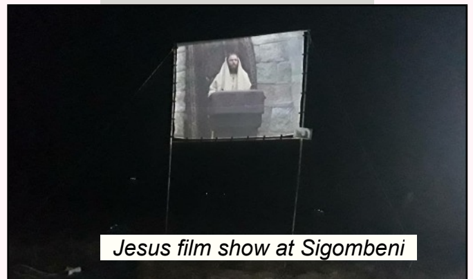
Jesus film show at Sigombeni