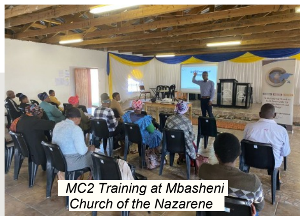
MC2 Training at Mbasheni Church of the Nazarene