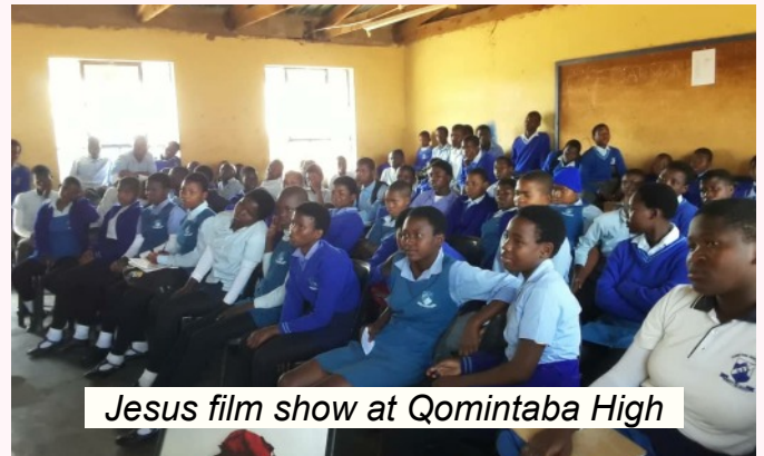
Jesus film show at Qomintaba High