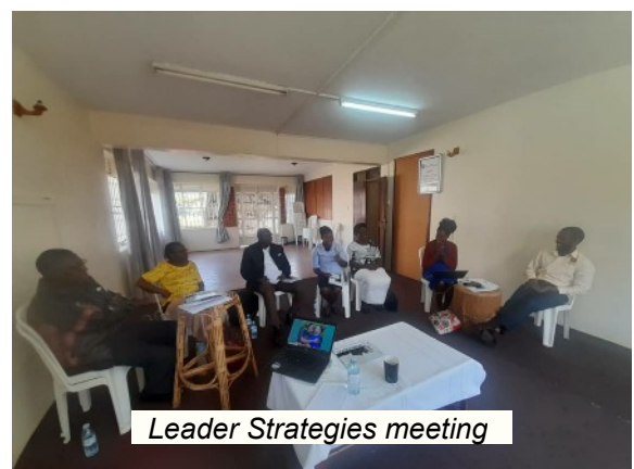
Leader Strategies meeting