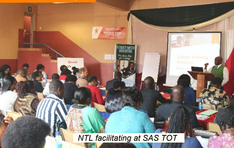
NTL facilitating at SAS TOT