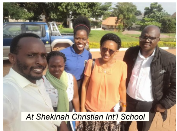
At Shekinah Christian Int'l School