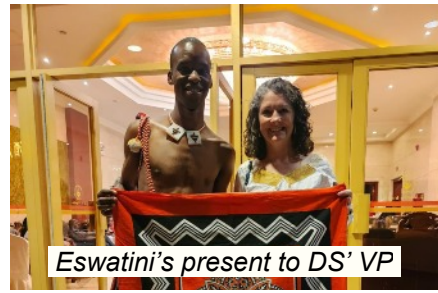
Eswatini's present to DS' VP

The theme of the year was one of our intent: Pioneering into Missional Gaps. This clearly stipulates that the gospel need to reach new places and new audiences where ministry hasn't been done in your country. This should be intentional in all countries to make sure that new places are being reached out to using the digital