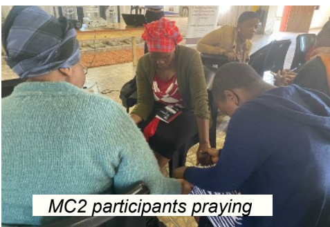
MC2 participants praying