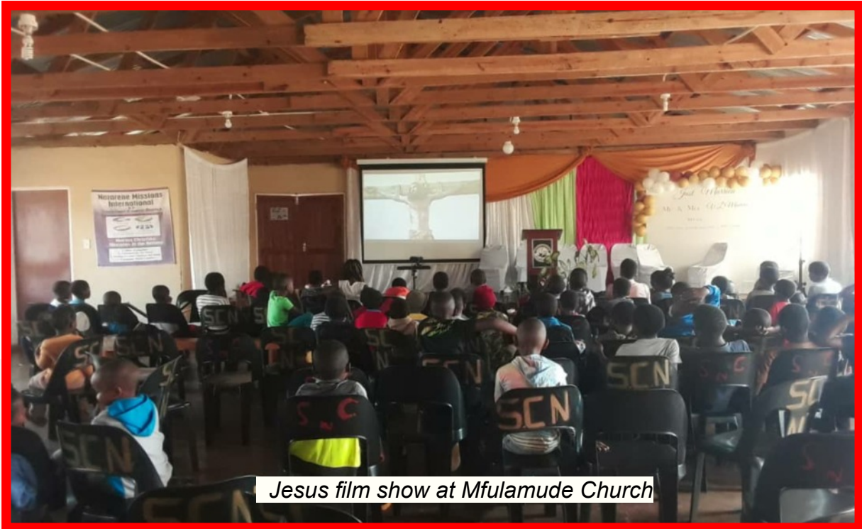
Jesus film show at Mfulamude Church