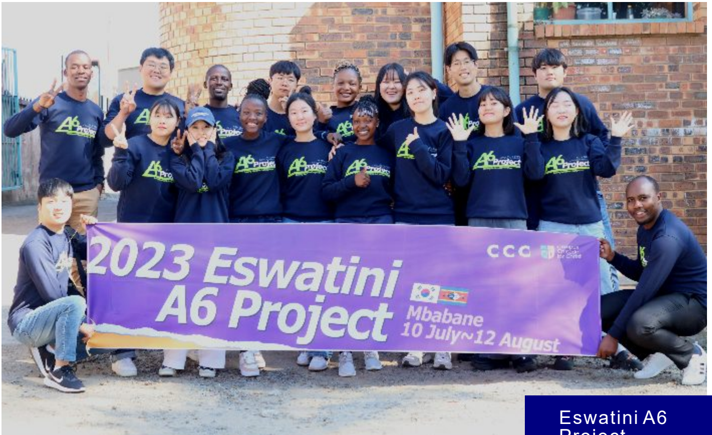
Eswatini A6 Project