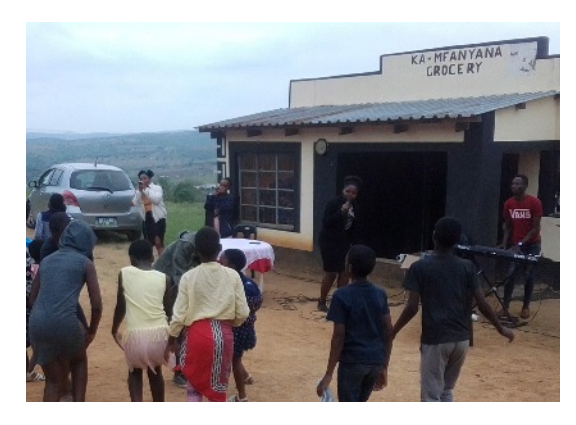
Above: An open air was held At Ka Mfanyana Grocery.

Below: A section of the training attendees pose with the 4 Spiritual Laws booklet Which was used to reach out