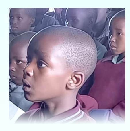
A learner reacts to the Jesus Film showing

On Wednesday, 28<sup>th</sup> September, the Jesus Film Project Eswatini showed the Jesus Film to over 300 learners at Sigombeni Primary School.